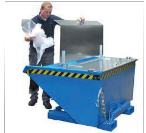
EXPO with lid