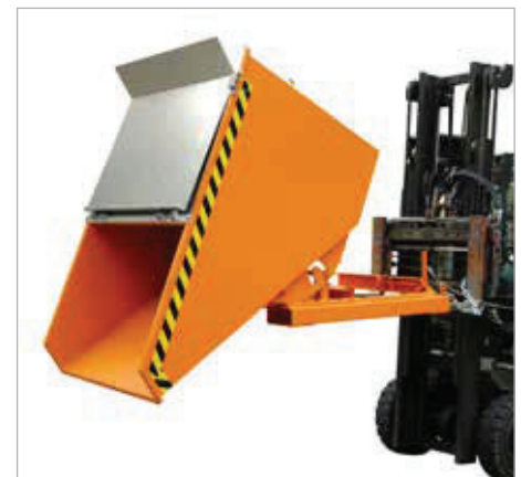
EXPO with lid