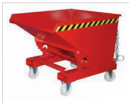
EXPO with castors