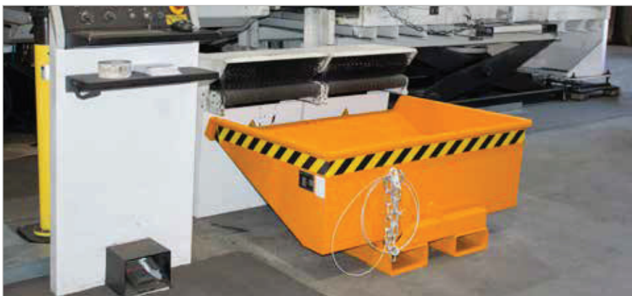
EXPO 150-275: ideal for use under machines as the dumping edge is only 445 mm high