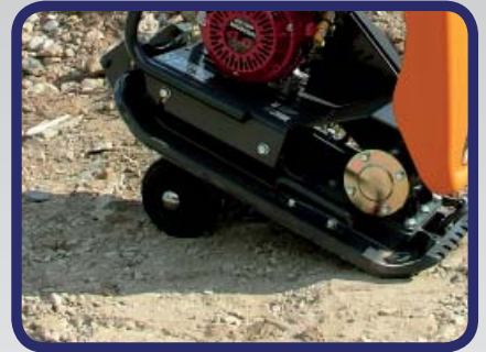
Wheel Kit Option