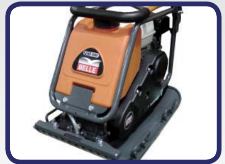
Water Kit & Spray Bar Option