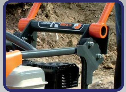
Unique Low HAV Mounting System

BELLE GROUP RESERVES THE RIGHT TO AMEND OR IMPROVE ANY SPECIFICATIONS IN THIS BROCHURE WITHOUT NOTICE.