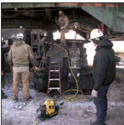
◀ Any brand of hydraulic torque wrench can be powered by the portable ZU4T-Series torque wrench pump.