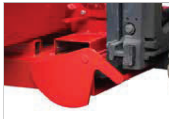
... automatic locking feature