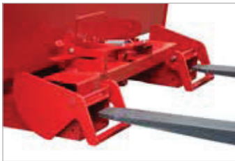
... drive the forks in