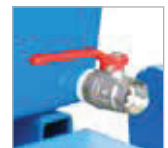
Drain cook 1" (S4A)