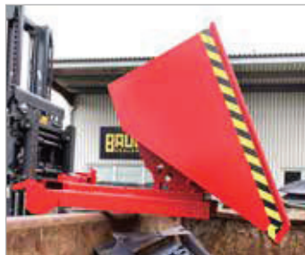
Emptied by activating release point 3