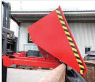
Emptied by activating release point 1