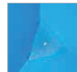
Perforated corner sieve (S4A)