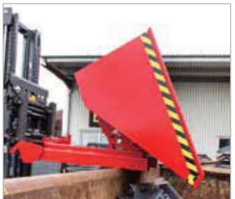
Emptied by activating release point 2