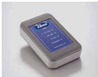
Elmasolvex® VA with wide range of accessories

The new standard for the use of flammable solvents in watch movement cleaning.