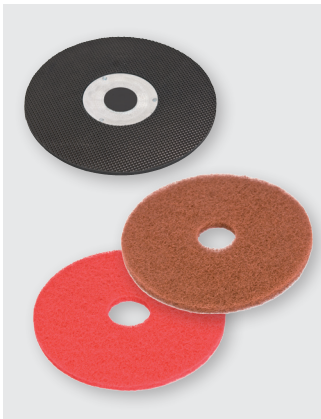
Padholder Rotoflex, Pad, brown and Pad, red