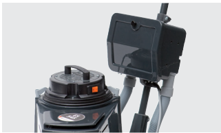
With integrated dust control