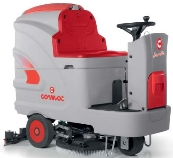
Innova 60 B