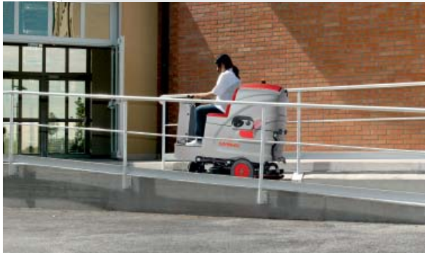
Low center of gravity for optimum stability. Capable of ramp gradients up to 18%