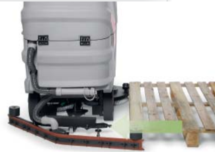
Automatic squeegee uncoupling when accidentally impacted