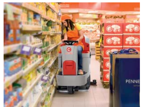
Easy rubber replacement without any tools on the exclusive Comac squeegee (Patent Pending)