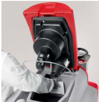
Easy and complete tank sanitizing

Easy battery charging thanks to the possibility of an onboard battery charger (on request)