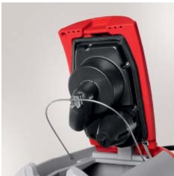
The suction head is silenced, guaranteeing a very low acoustic pressure level and allowing to perform in highly noise-sensitive environments such as nursing homes and hospitals, without disturbing the environment or the people who live in it