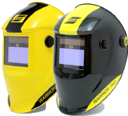
Lightweight helmet 520g

The WARRIOR™ Tech helmet provides ideal functionality, performance and comfort to the occasional welder, maintenance and construction workers through to the professional welder.