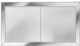
Available with dioptric configurations As standard