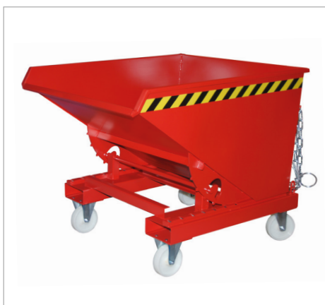
Type EXPO with castors