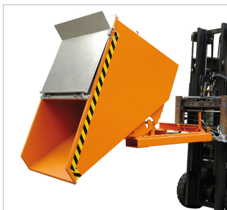
Type EXPO with lid