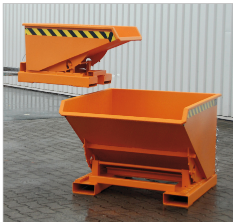
Type EXPO 150 and Type EXPO 600