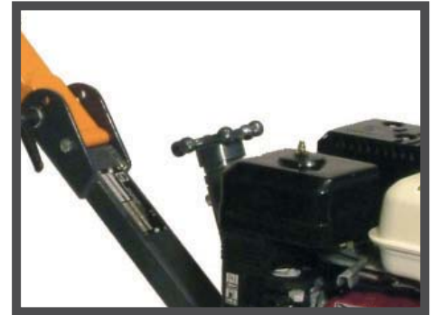
'SCREW PITCH' FOR EASY BLADE ADJUSTMENT