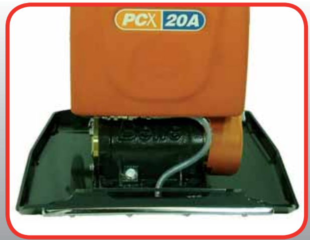
Tapered Baseplate To Avoid Track Marks