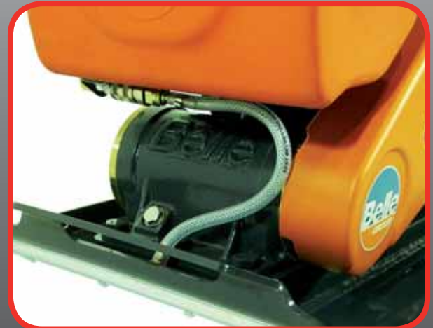
Large Watertank And Spray Bar