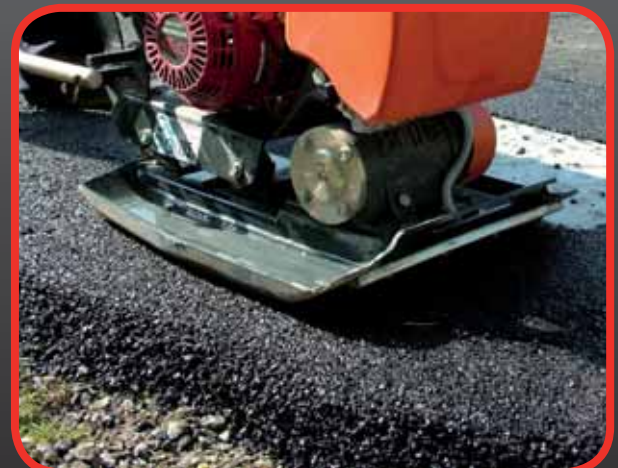
Ideal for Asphalt