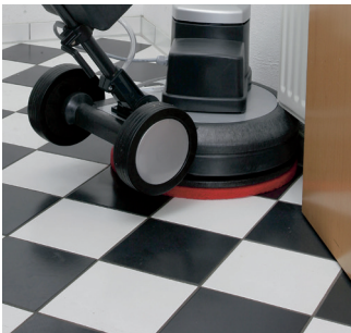
Working up to the rim