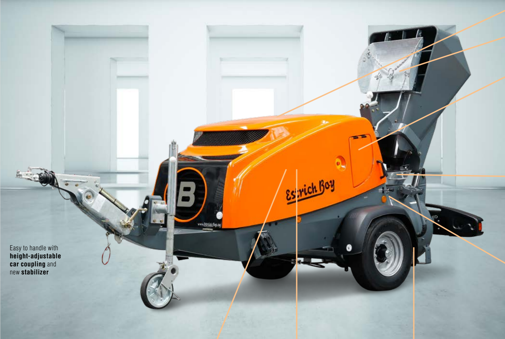
Easy to handle with height-adjustable car coupling and new stabilizer