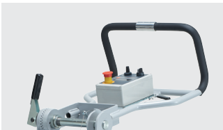
Tools for any application