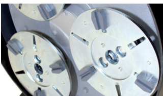
Robust in design