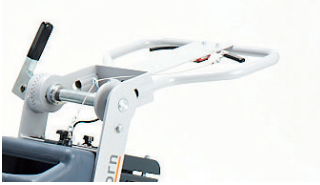
With integrated water dosing