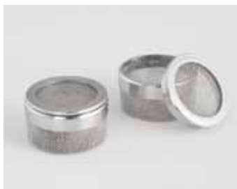
Elmasolvex ® RM with wide range of accessories