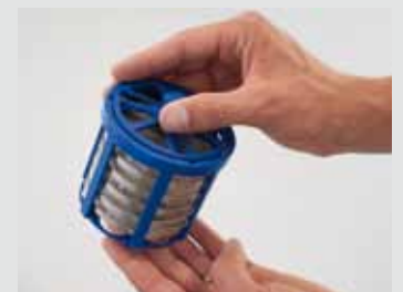
Removing cleaned and dried baskets