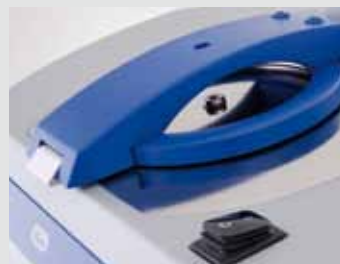
Vacuum is established