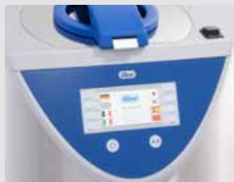
Selecting and starting program