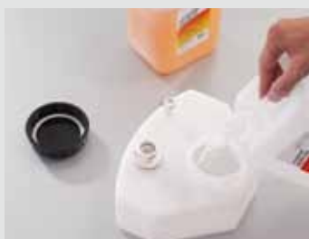
Filling cleaning and rinsing solution