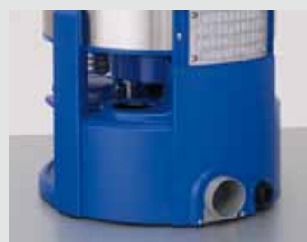
Connection to controlled exhaust air routing