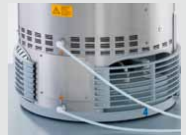
Controlled exhaust air routing