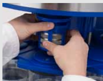
Inserting basket with watch parts