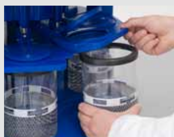
Filling and inserting media containers