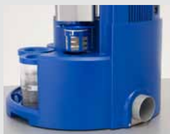
Connecting to exhaust air routing