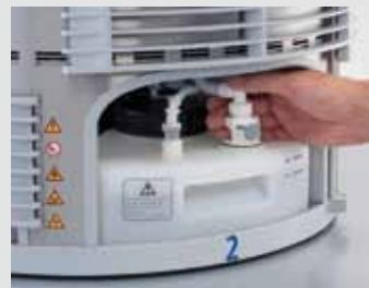
Connecting media containers