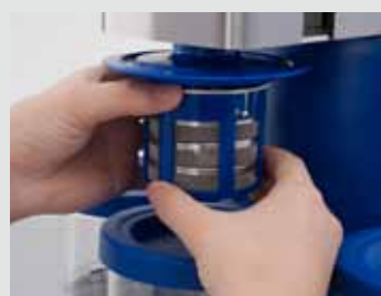
Inserting basket frame

Elmasolvex® SE with wide range of accessories