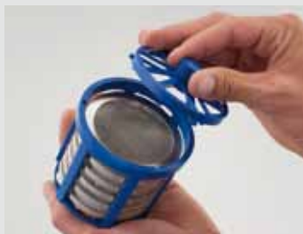
Filling baskets with watch parts

Elmasolvex® VA has its own self-contained intrinsic Ex-protection due to the vacuum technology used and all the measures required by TÜV and the applicable technical regulations for explosion safety. This means that the explosion protection measures integrated in the machine already rule out any fire hazard in the primary zone, operation in compliance with the manual provided. The use of ultrasound is thus legally possible and permitted. The TÜV test performed confirms the requirements for the use of the prescribed CE mark.