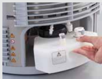
Installing media containers