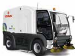
With 2 side brushes (standard)