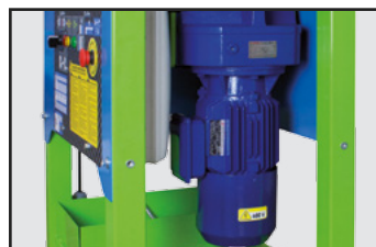
Heavy-duty motor-reducer, 0% power loss.