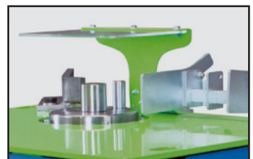
Curved and transparent shield protection visor for 360 degree visibility.