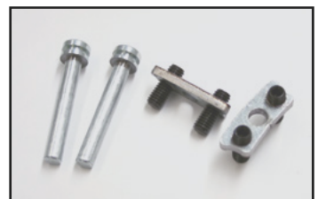
Angle selection pins with memory holders for 2 different angles programme.