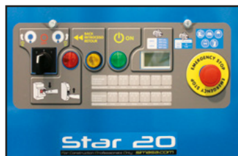
Full featured control panel.