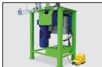
Removable panels for easy maintenance access.