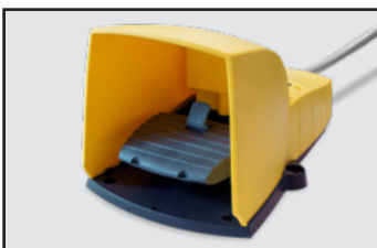
Safety foot pedal control.