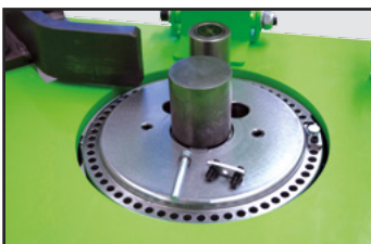
Bending turning plate ergonomically designed for an easier operation.