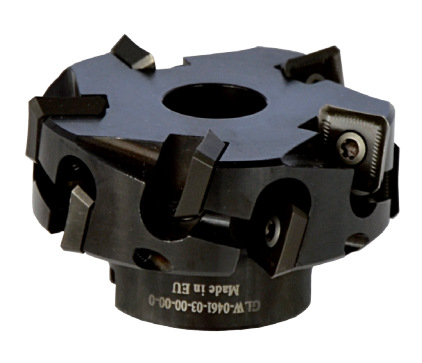
Mono block milling head, with 10 indexable inserts fixed with screws.