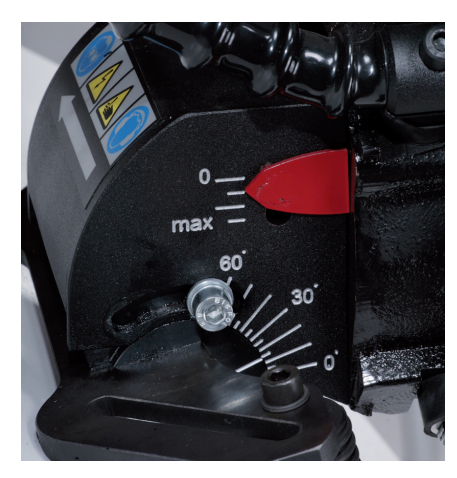
Continuous angle adjustment from 0 to 60 degrees.