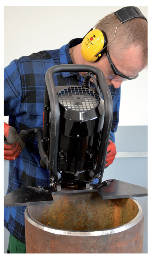
Plate facing-off Plate beveling Pipe beveling