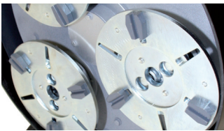
Robust in design