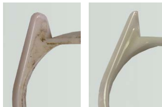
Removal of polishing paste