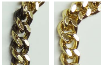
Removal of polishing paste