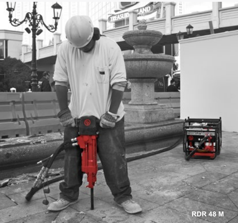
RDR 48 M