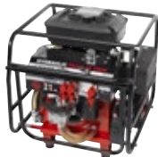
PAC P18 TWIN