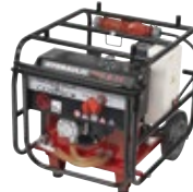
PAC E11 (Twin Not Pictured)