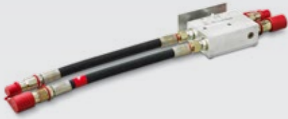
OIL FLOW DIVIDER