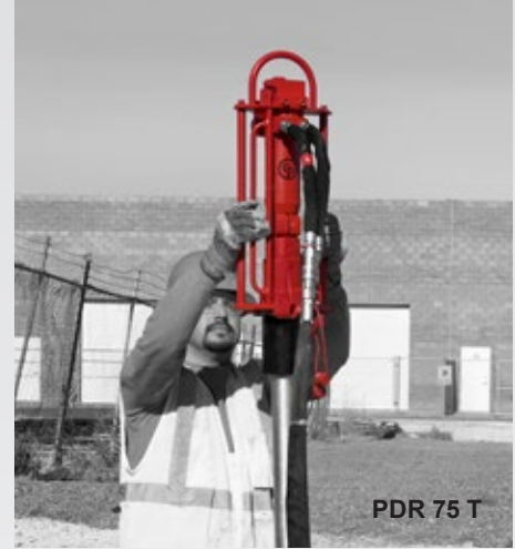
PDR 75 T

Driving down posts or rods for fences, road signs, crash barriers, tent anchors, or other purposes calls for a tough machine with plenty of power. CP post drivers deliver, whether it's in soft soil or rock-hard asphalt. The sheer force of the blows is impressive, so you can drive down posts in record time with virtually no effort.