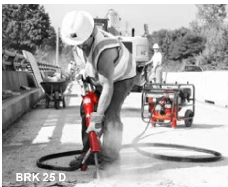
BRK 25 D

Hoses, power packs and tools are fitted with flat-face EHTMA quick-release couplings for fast, easy connections. Couplings are designed to help keep hydraulic systems free of dust and dirt. Male and female couplings are mounted according to EHTMA standards, preventing connection mistakes and ensuring that the oil flow direction is always correct when tools are connected to PACs or OFDs.