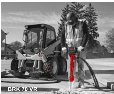
BRK 70 VR