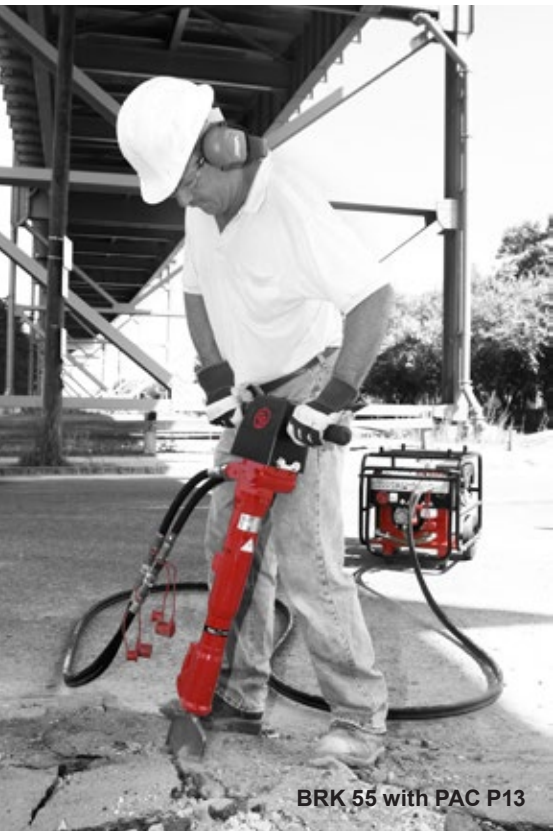
BRK 55 with PAC P13

CP hydraulic power packs are available in gasoline, diesel or electrically driven versions and are designed to provide portable power for a wide range of applications in the 20-40 l/min at 140-172 bar range.