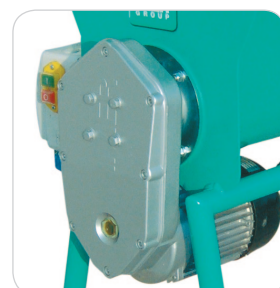
Patented IMER gearmotor