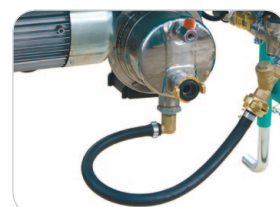
Spin 15A water pump