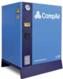
Compressor base mounted