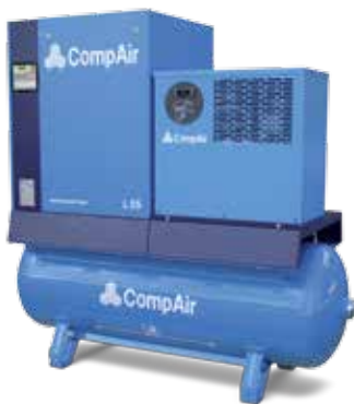
Complete airstation including compressor, dryer and receiver