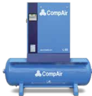
Receiver mounted compressor