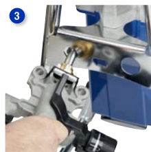
Use frame hex fitting to loosen pump and remove cartridge