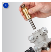
Install new cartridge and replace pump