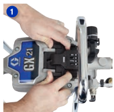
Slide & lift open access door