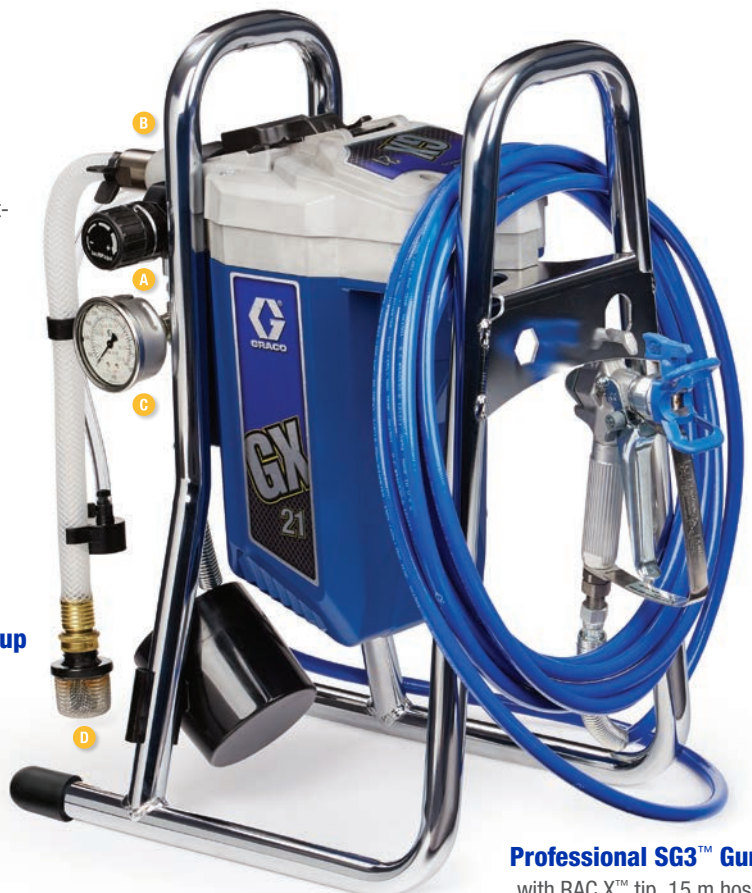
Professional SG3™ Gun with RAC X™ tip, 15 m hose