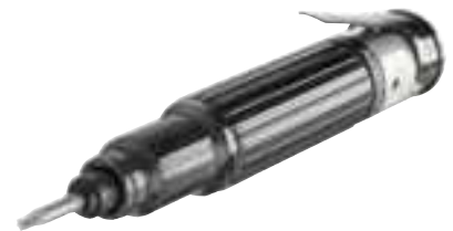
S2416-L / S2426-L / S2428-L