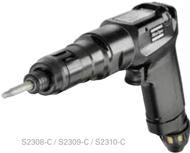
S2308-C / S2309-C / S2310-C

Both versions feature adjustable torque settings, trigger and push start for pistol grips, and lever and push start for straight models.