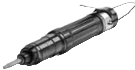
S2340-C / S2360-C / S2370-C