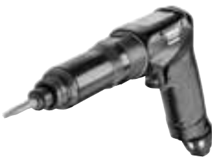
S2450-P / S2451-P / S2452-P