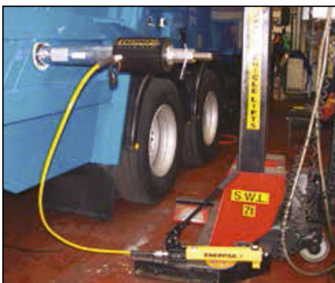
◀ An RACH-306 powered by a P-392 hand pump used to extract corroded carriage pins of refuse collection vehicles.