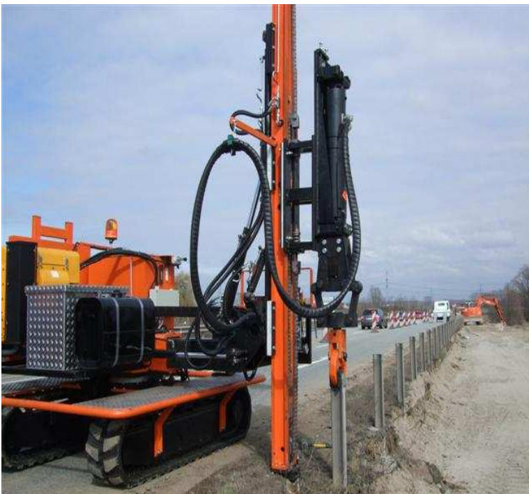
Fig. Extractor unit

Due to replaceable and readjustable bronze slide rails in all mobile parts such as e.g. slide chariot and feed pipe as well as solid hydraulic valves "MADE IN GERMANY" especially designed for construction machinery a long service life is ensured. Equipped with an optimal turn drive unit and down-hole hammer, the machine can be modified into a drilling truck within a short time for drilling shells at crossings and for pile-driving