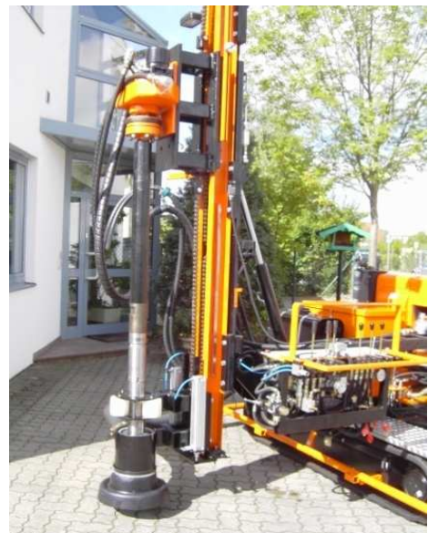
Fig. Drilling Unit