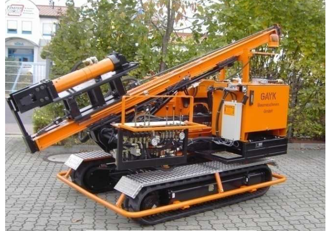
Fig. Transport position

The fully hydraulic ram HRE is based on a solid tracked truck with live ring and rubber chains. The drive is a Hatz two or three-cylinder Diesel engine which has proven itself in many construction machines. As we attach great importance to stability, it is also possible to extract posts and drill holes for shells. The modification equipment for extraction consists of two drawbars, ram block, and clamping tongs retainer with clamping tongs. The modification time is approx. 15 min. After that, 1 person is able to extract posts quickly, safely, and without any problems without using a truck crane and post extractor. With a feed of 1.9 m from the front edge chain to the centre of hammer and a useful height of 3 m even big posts can be rammed