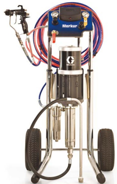
Air-Assisted Cart Package