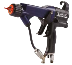
PRO Xp™ Air-Assisted Electrostatic