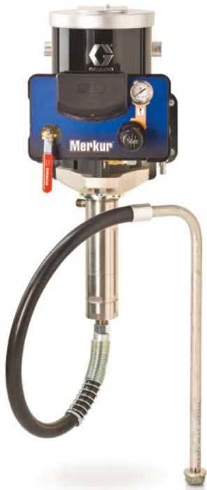
Airless Wall Mount Package