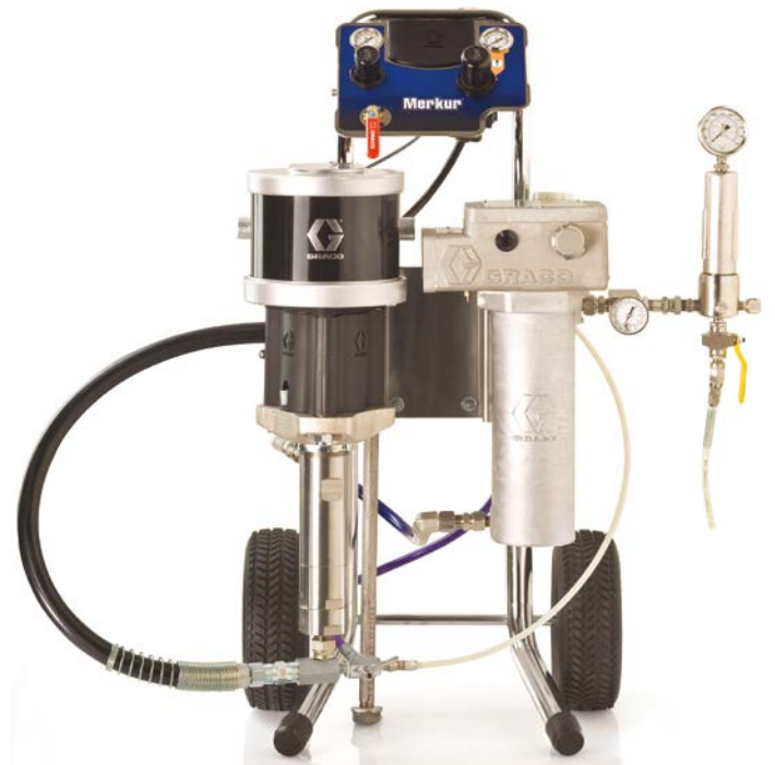
Heated Air-Assist Cart Package

*All packages have a 7.5 m (25 ft) fluid and air hose