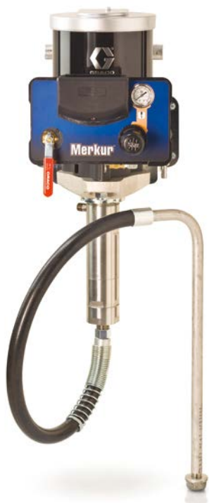
Airless Wall Mount Package