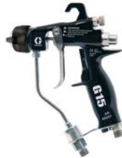
G15™ / G40™ Air-Assisted Gun