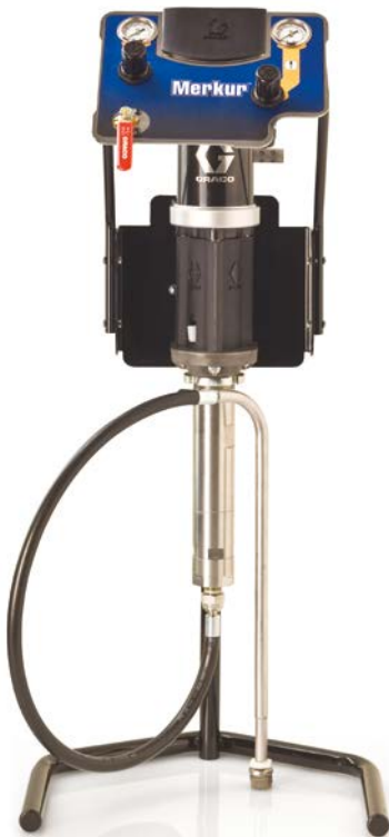
Air-Assist Stand Package