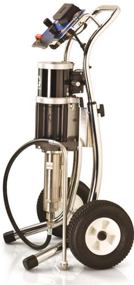
Air-Assisted Cart Package