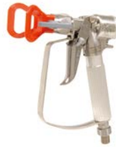
XTR™ Airless Gun