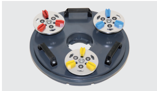
... ETX diamond tools