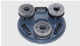
... cleaning brushes