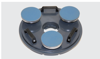
... sanding discs