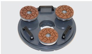
... resin bond diamond pads