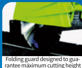
Folding guard designed to guarantee maximum cutting height