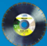
Marble Ø 300, 350 mm page 92