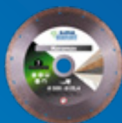
Keramax Ø 300, 350 mm page 93