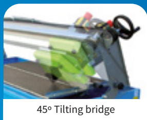
45° Tilting bridge