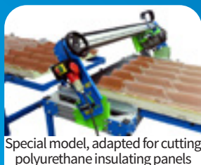
Special model, adapted for cutting polyurethane insulating panels