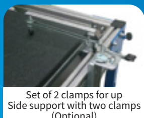
Set of 2 clamps for up Side support with two clamps (Optional)