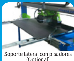
Soporte lateral con pisadores (Optional)