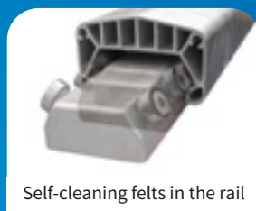
Self-cleaning felts in the rail