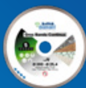
Gres continuous rim Ø 300, 350 mm page 93