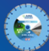
Combi Ø 300, 350 mm page 95