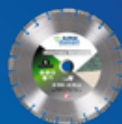
Abrasive materials Ø 300, 350 mm page 94