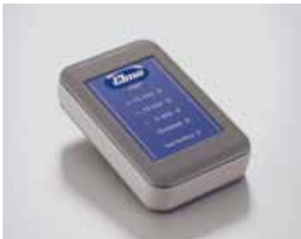
Elmasolvex® VA with wide range of accessories

The new standard for the use of flammable solvents in watch movement cleaning.