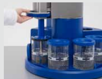
Raising, lowering and closing