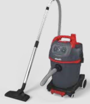
NSG uClean LD-1432 HMT The lightweight vacuum cleaner (wet-dry) with 32l containers 016276