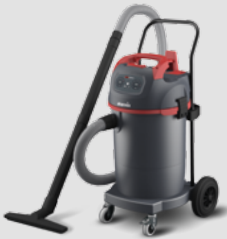
NSG uClean 1445 ST The coarse dirt vacuum cleaner (wet-dry) with 45l container 016252

All LD appliances are distinguished by an additional noise insulation feature and an ability to select eco mode.