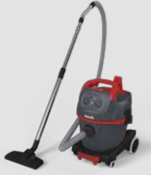
NSG uClean LD-1420 HMT The lightweight vacuum cleaner (wet-dry) with 20l container 016269