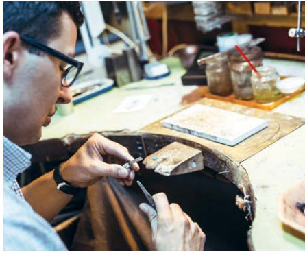
Cleaning of rings, necklaces, earrings, etc.