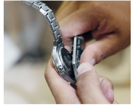
Cleaning of watch parts like straps, cases, etc.

Elmasonic xtra TT tabletop ultrasonic devices are designed for use in production environments, workshops and servicing. Features like the permanently integrated Sweep-function, the switchable Dynamic-function or the individually settable limit temperature with LED warning indicator make the cleaning of parts in day to day work much easier.