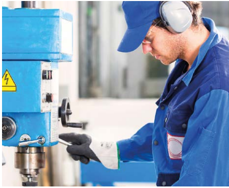
Industrial parts cleaning of motor parts, filters, etc.

Robust tabletop ultrasonic devices for heavy-duty applications